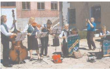
Entertaining the inhabitants of the local prison. Dalriada were protected by razor wire and bars from the audience.