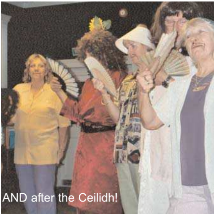
AND after the Ceilidh!