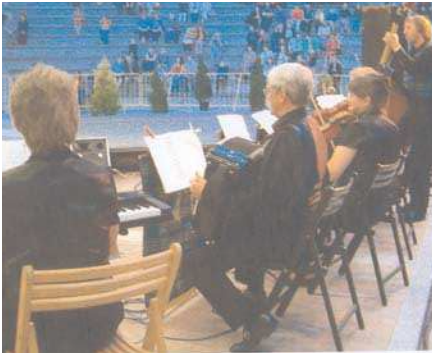
Warming up the audience in the arena in Biala Podlaska.

Dalriada's visit to Poland last July saw them entertaining all sections of the population.