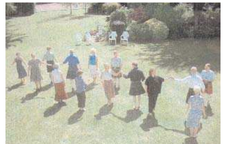
A reunion of the French dancing group in Westbury on Trym during August (a rare sunny afternoon!)

Two more favourites of the region: Crème de Mur (Blackberry liqueur) + red wine mixed